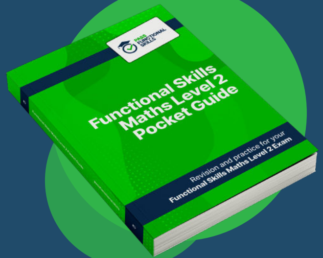
Functional Skills Maths Level 2 Pocket Revision Guide