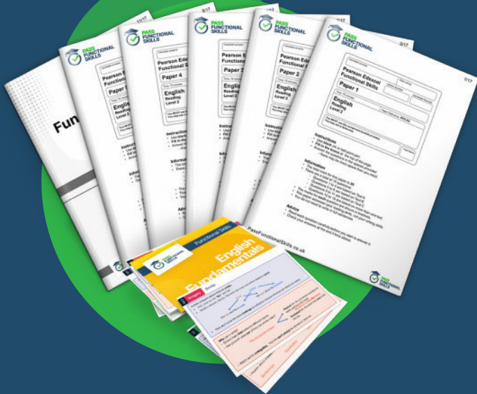
Functional Skills English Level 2 Practice Papers & Revision Cards