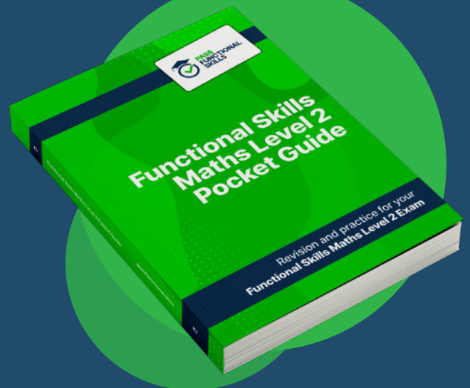
Functional Skills Maths Level 2 Pocket Revision Guide